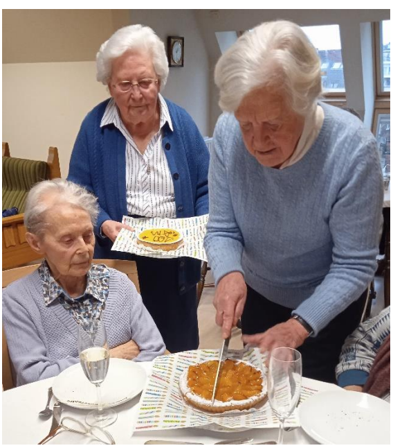
A nice tart could not miss